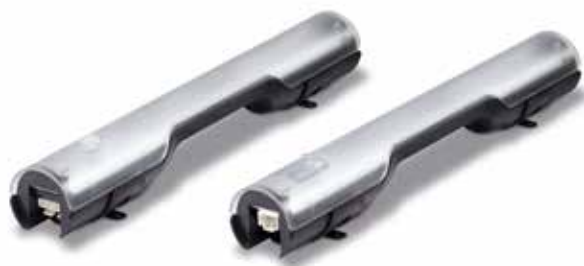
Type 7L.43 (600 lumens)